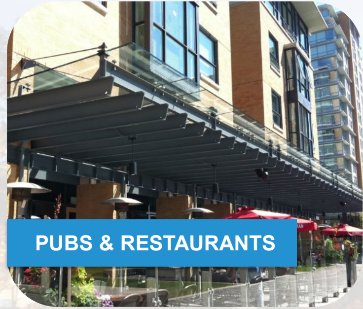
PUBS & RESTAURANTS