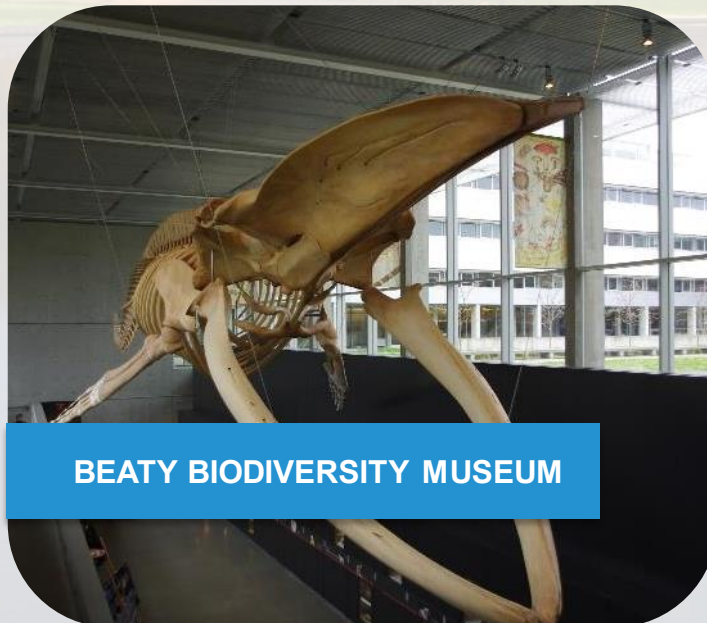
BEATY BIODIVERSITY MUSEUM