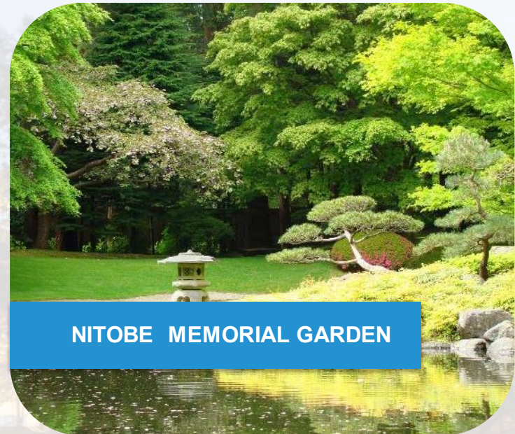
NITOE MEMORIAL GARDEN