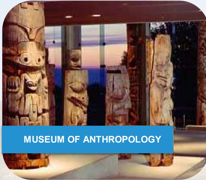
MUSEUM OF ANTHROPOLOGY