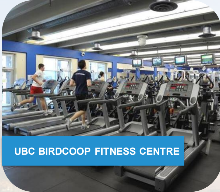
UBC BIRDCOOP FITNESS CENTRE