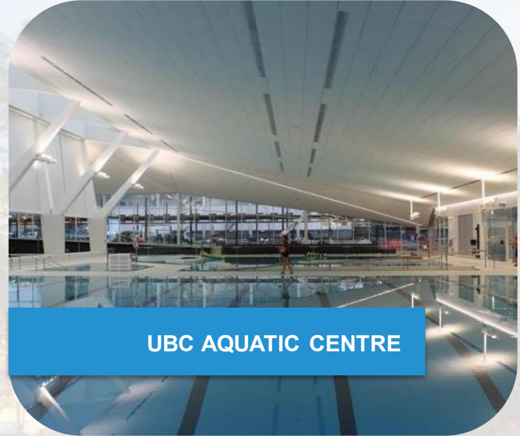
UBC AQUATIC CENTRE